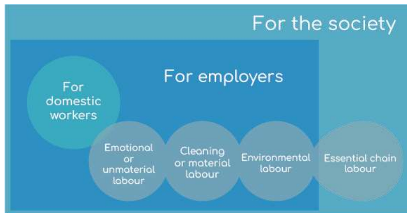
Figure 1. Levels and dimensions of the value of domestic work

Source: own elaboration based on the FGD and interviews, 2022.